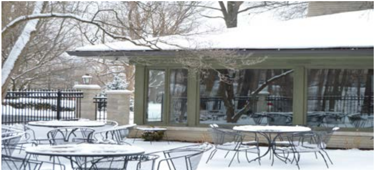
Harlos courtyard in winter